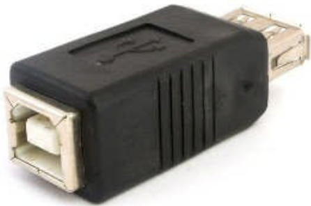
USB A female to USB B female (option)